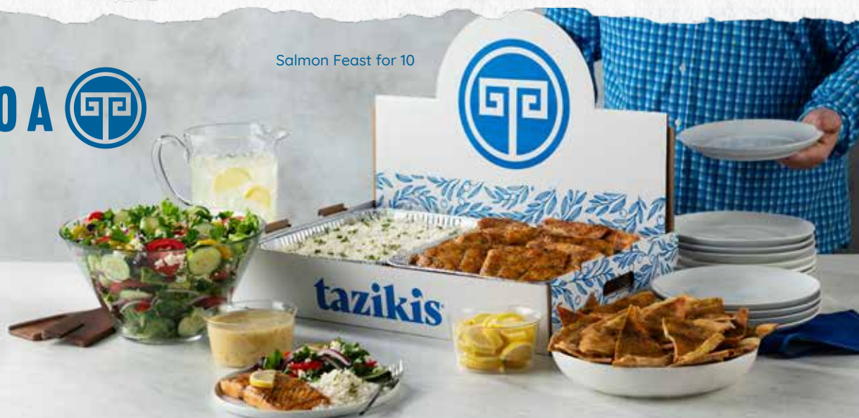
Salmon Feast for 10